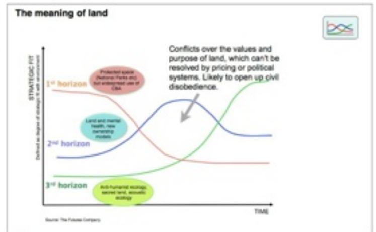
Images: The UK Foresight Programme. Published under the UK Open Government Licence .