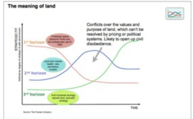
Images: The UK Foresight Programme. Published under the UK Open Government Licence .